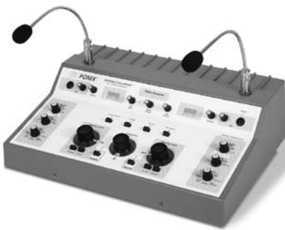
FONIX FA-10 shown with optional gooseneck microphones