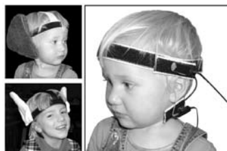
Infant/Child Headband Package