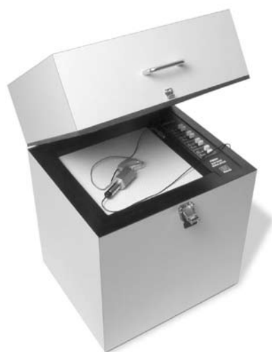
7020 Sound Chamber