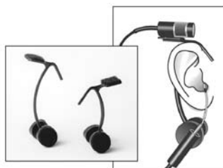
Wedge style ear hook: Adult and child size