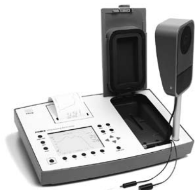
FONIX FP35 Hearing Aid Analyzer