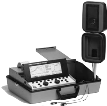
FONIX FP40 Hearing Aid Analyzer