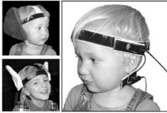
Infant/Child Headband Package