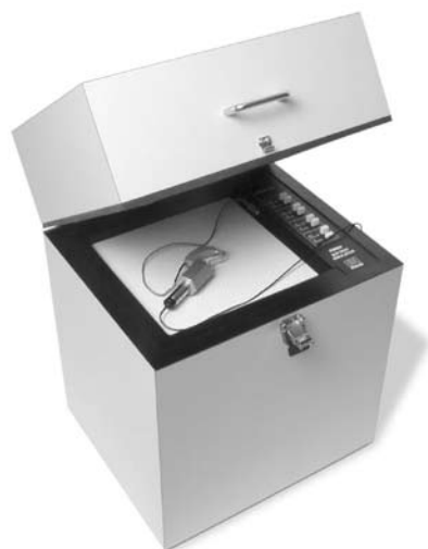
7020 Sound Chamber