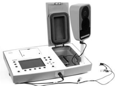
FONIX FP35 Hearing Aid Analyzer