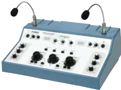
FONIX FA-10 shown with optional gooseneck microphones